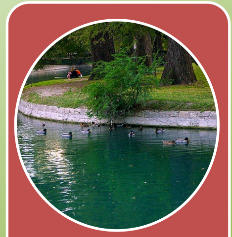
Restore Natural Features & Improve Water Quality