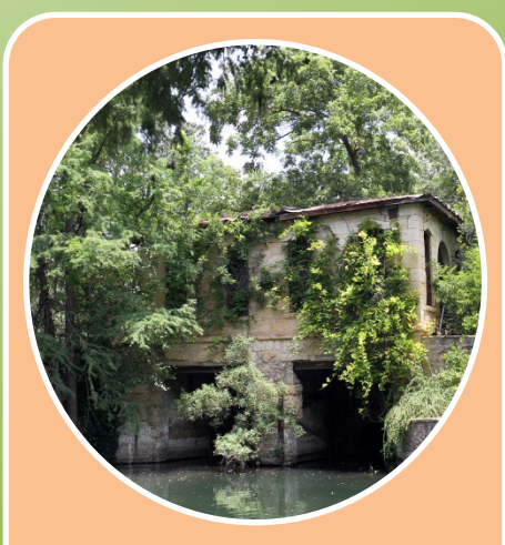
Preserve & Restore Cultural & Historic Features